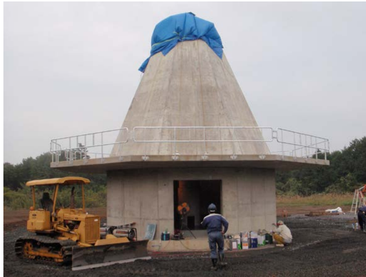
Figure 3. Ishioka VGOS telescope (pedestal) under construction.